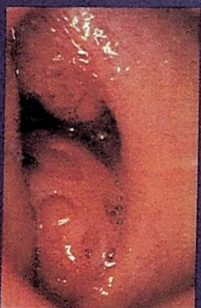
The removal of enlarged tonsils like this can relieve airway obstruction.

We will only take tonsils out if they cause recurrent sore throats despite treatment with antibiotics. The other main reason for removing tonsils is if they are large and block the airway. A quinsy is an abscess that develops alongside the tonsil, as a result of tonsil infection, and is most unpleasant. People who have had quinsy therefore often choose to have a tonsillectomy to prevent having another. Tonsils are also removed if we suspect there is a tumour in the tonsil. A rapid increase in the size of a tonsil or ulceration or bleeding occurs if a tumour of the tonsil develops. Tumours of the tonsil are rare.